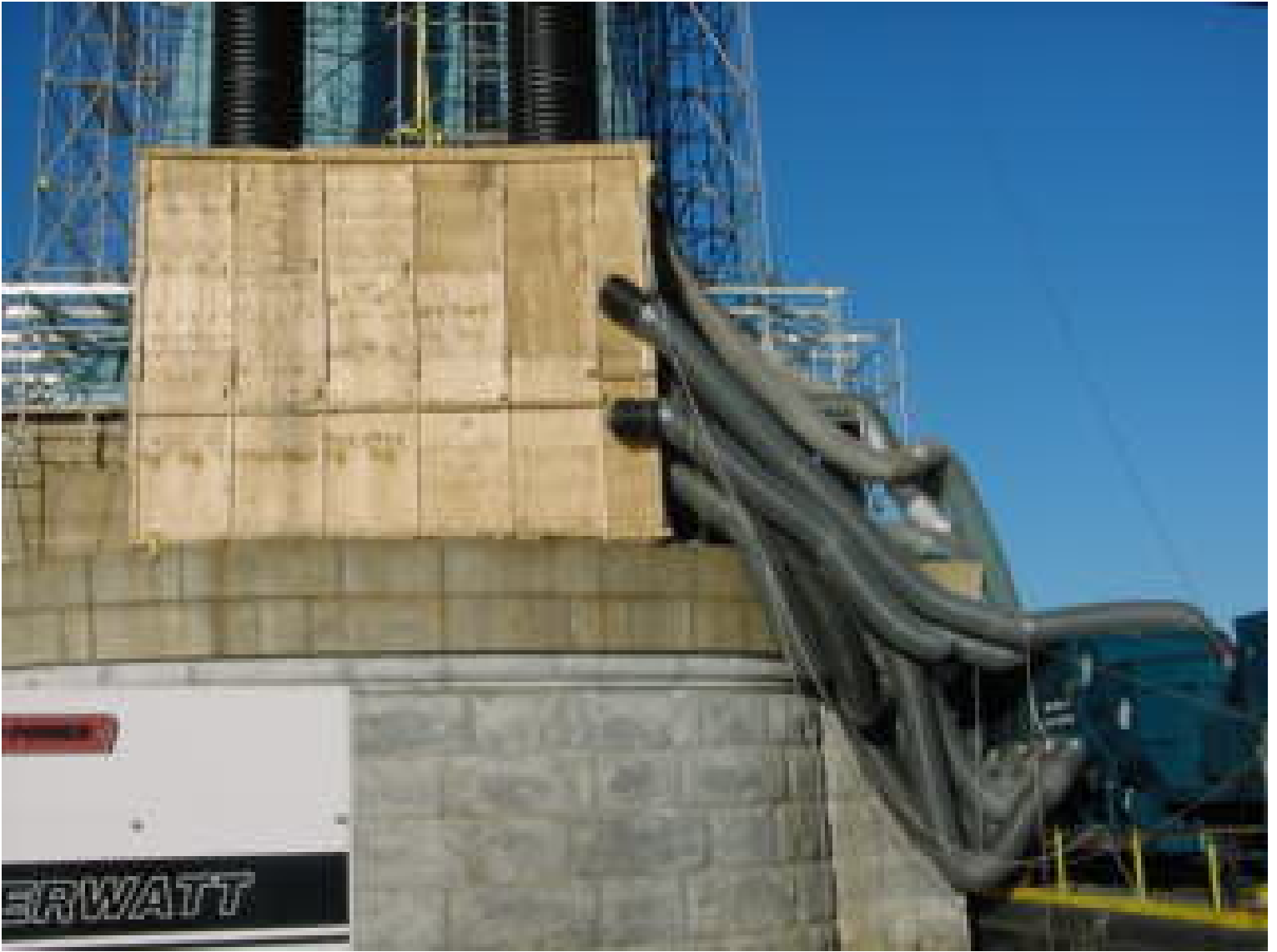
Ben Franklin Bridge Tower – Exhaust Ducts From Dust Collector