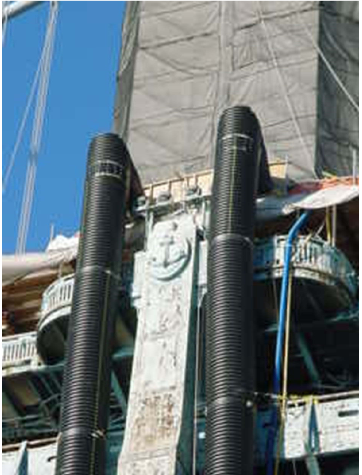
Ben Franklin Bridge Tower – Exhaust Ducts

PROJECT DESCRIPTION: Dust Collection Engineering – Various Projects Project