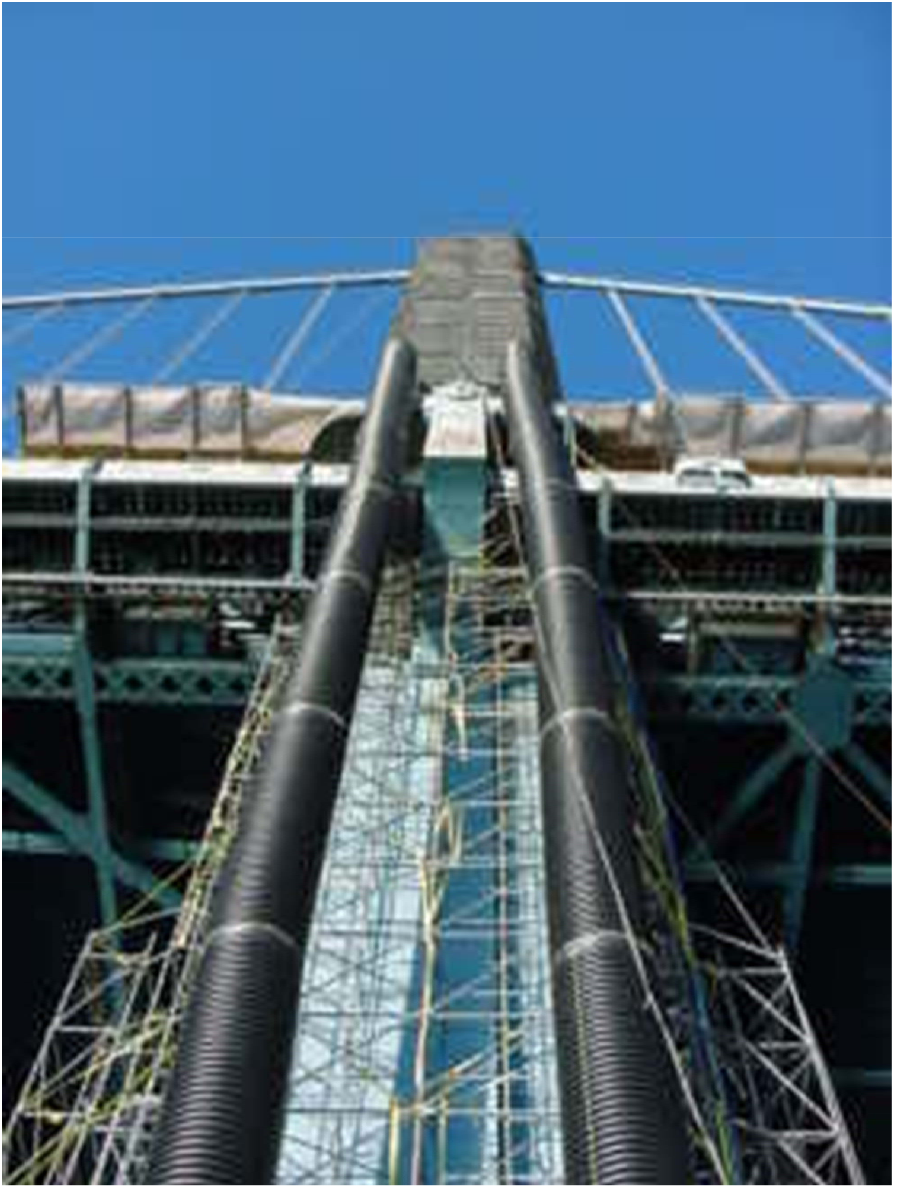
Ben Franklin Bridge Tower – Scaffold Supported Exhaust Ducts