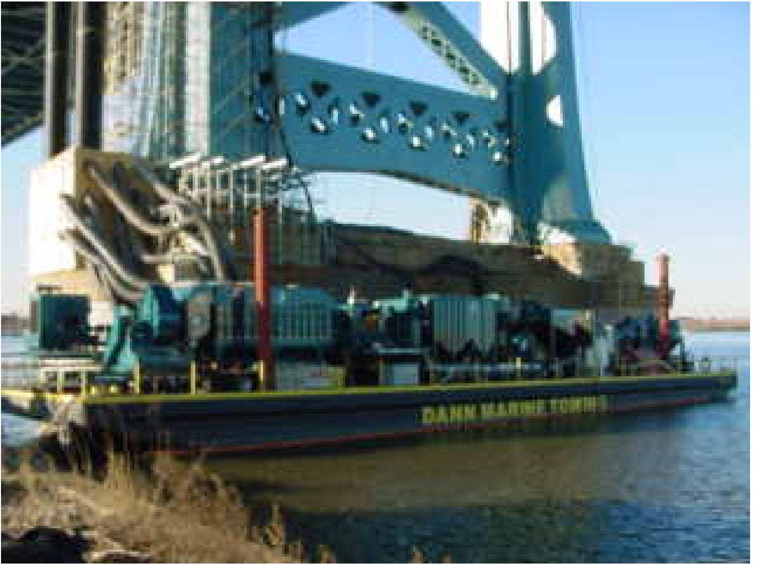
Barge Mounted Dust Collectors Grit Recycler & Air Compressors